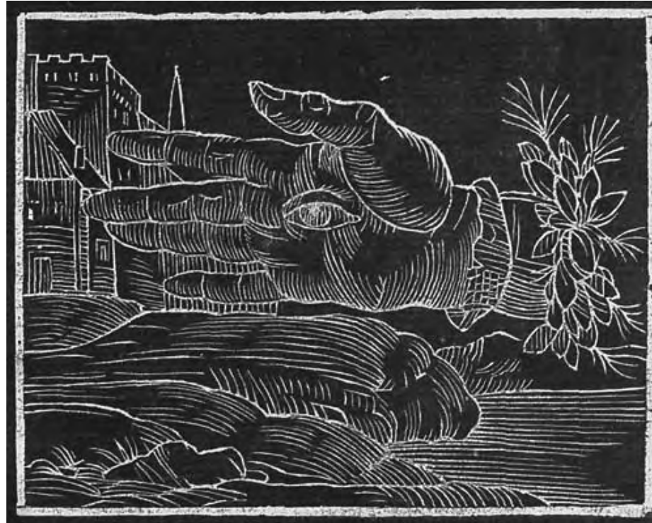
Manus Occulata in Andrea Alciato (1546) Emblematum libellus, Venice (negative)

2009 Interstices Under Construction Symposium